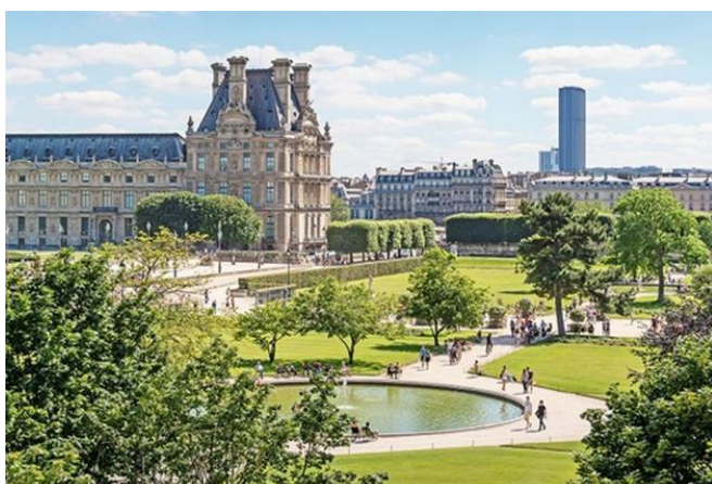
Jardin des Tuileries & Le Palais Royal