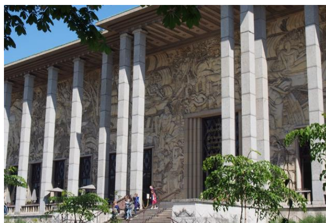
Porte Dorée - Musée de l'Immigration