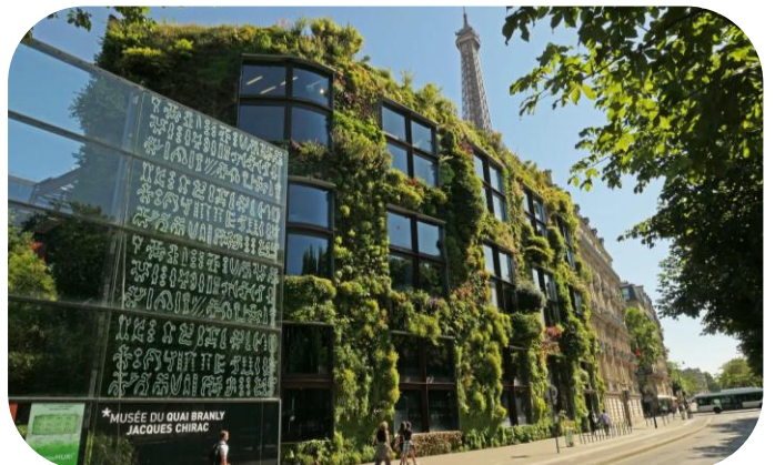
Musée Quai Branly – Jacques Chirac