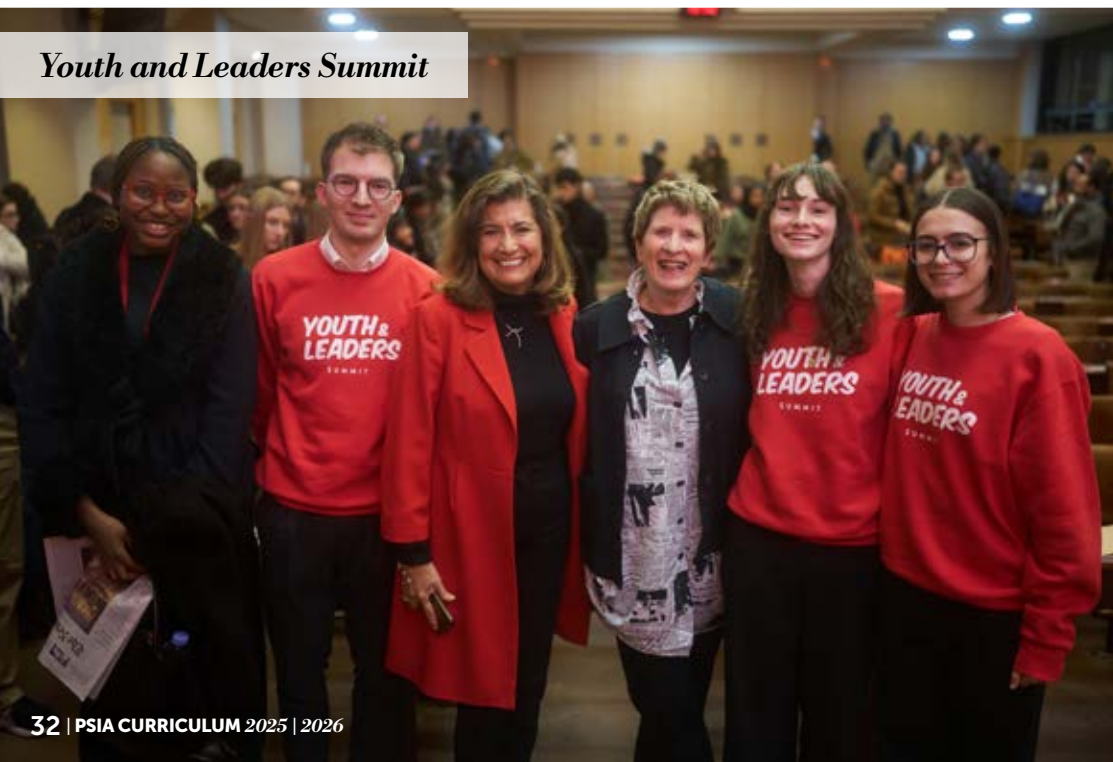
Youth and Leaders Summit