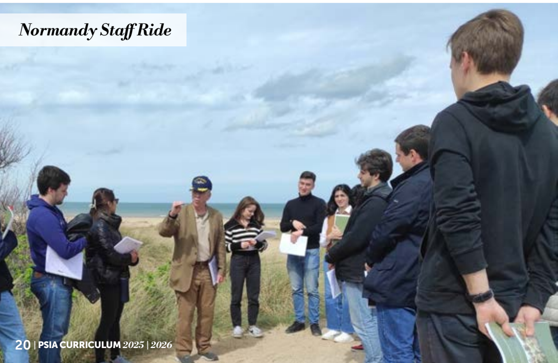
Normandy Staff Ride

a progressive pace so students can acquire and refine their analytical and critical skills. With faculty drawn from both academia and the field, including the military sector, students are constantly challenged to better understand security issues on both international and regional stages. The diverse expertise of the faculty enhances the depth and practical application of the knowledge acquired during the program.