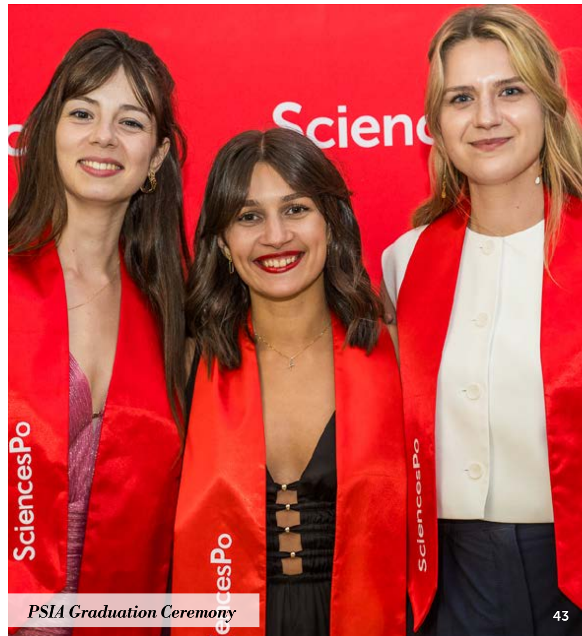
PSIA Graduation Ceremony