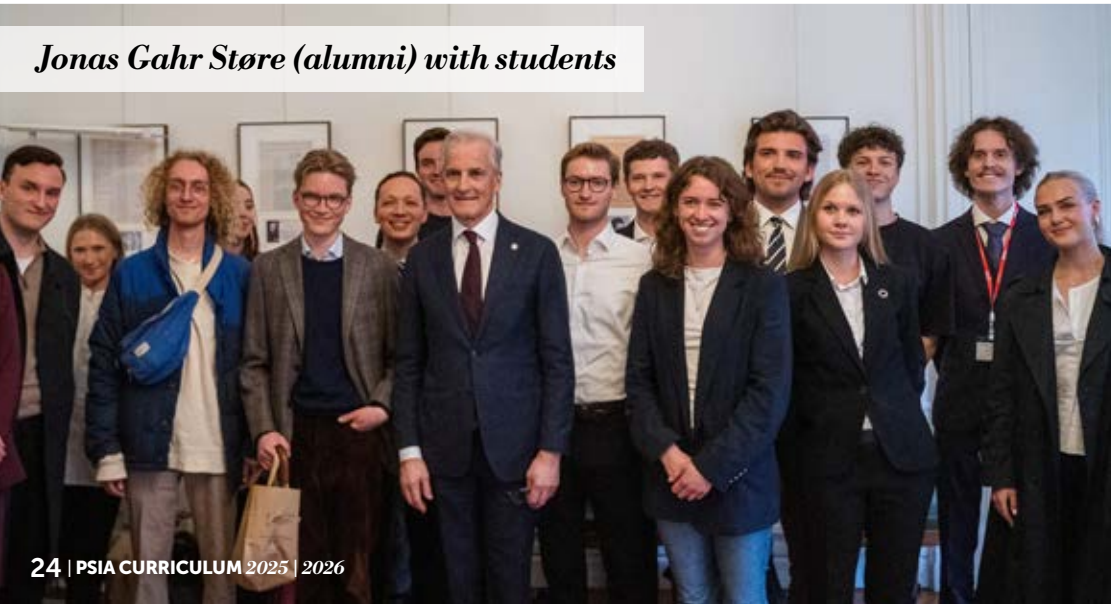
Jonas Gahr Støre (alumni) with students

level practitioners in the field, including diplomats, and practical components are emphasized in all courses. Through case studies, simulations, and expert-led seminars, students learn to craft policy, mediate conflict, and lead with integrity in international arenas. Students are encouraged to engage critically with course materials in a manner that aligns with their professional goals. The Master incorporates Diplomacy as a mandatory concentration for all students.