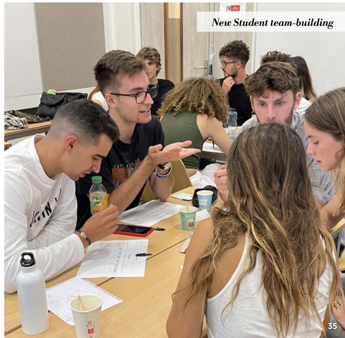
New Student team-building

One extra course from Block 5_APPLIED ECONOMICS AND FINANCE or from Block 6_ADVANCED TOPICS IN DEVELOPMENT