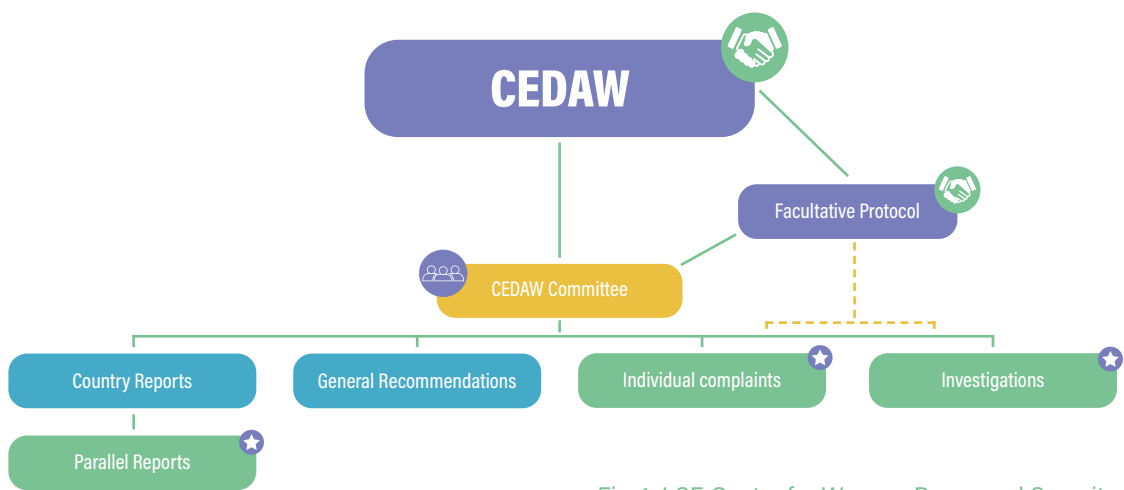
Fig. 1: LSE Centre for Women, Peace and Security

During the sessions of the Committee on the Elimination of Discrimination Against Women (the Committee), its 23 independent experts monitor the implementation of CEDAW. The Committee recognizes the importance of knowledge from the grassroots and welcomes collaboration with NGOs in its session and pre-session periods.