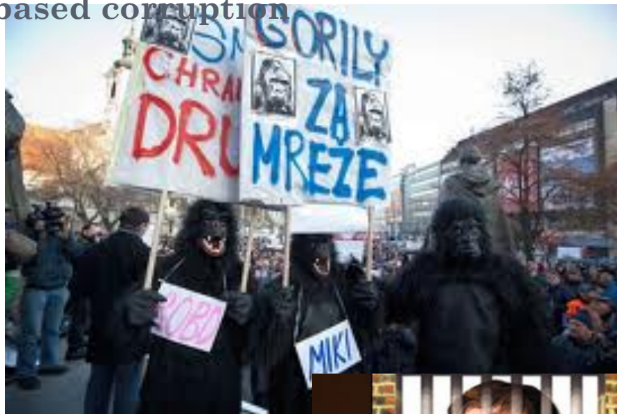
Gorilla corruption case in Slovakia

Two of the most corrupted Czech politicians