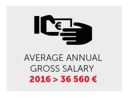
Table 6: Average earnings France / abroad

The average gross annual earnings were higher abroad than in France.